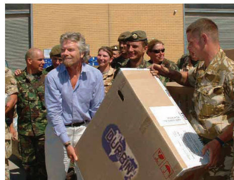
Virgin Atlantic requested urgent medical supplies for the first flight to Basra at the end of the Gulf War. Durbin PLC responded immediately with wheelchairs, oxygen masks, crutches and a range of cancer drugs.

Durbin has wide experience in the donation of excess stock from pharmaceutical companies to the developing world. We combine our expertise in clinical trial supply with being one of the leading suppliers to the charity sector. In the last five years US $35 million of donated pharmaceuticals and equipment have been distributed by Durbin across the world.